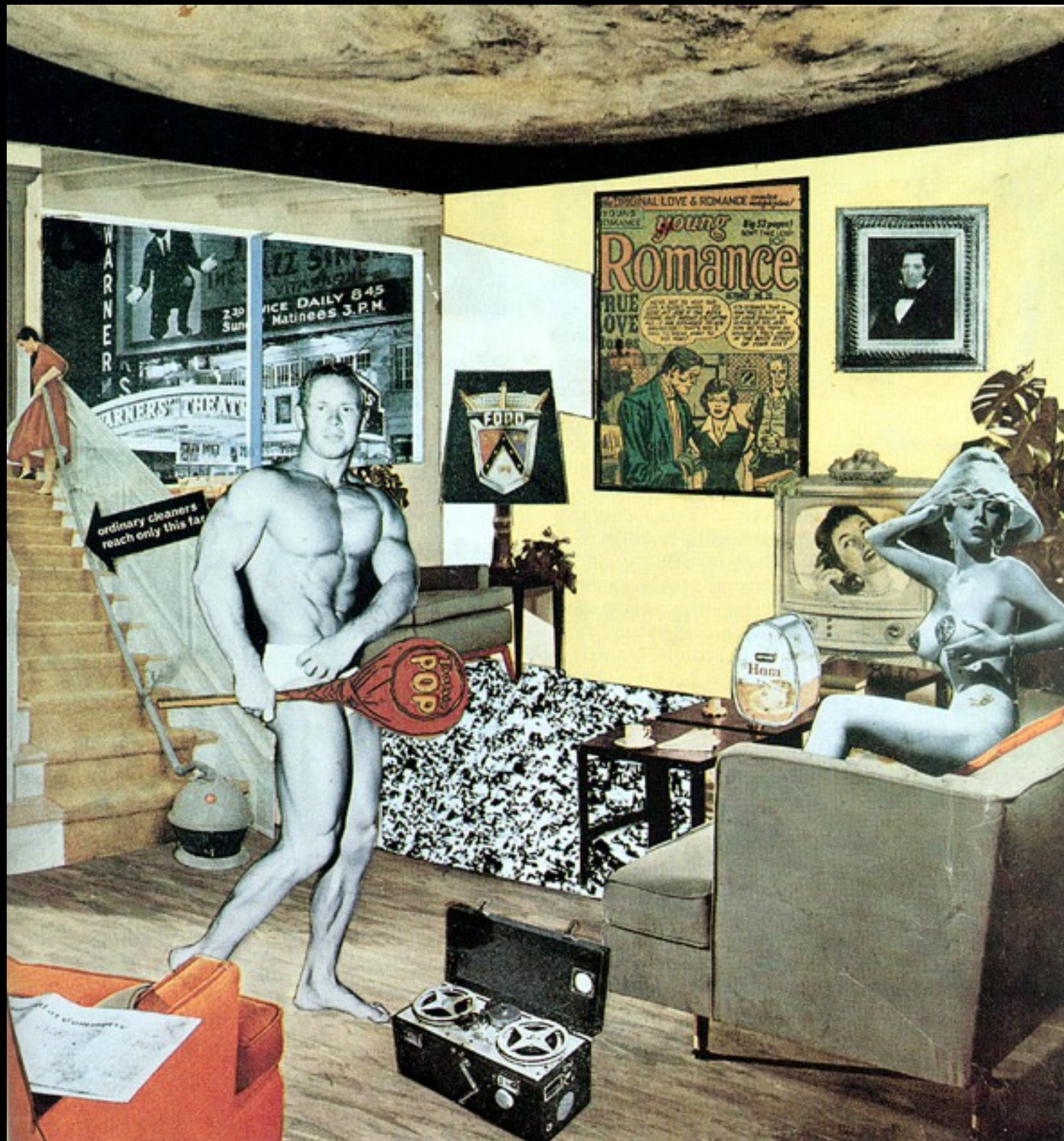
Richard Hamilton, Just What Is It That Makes Today's Homes So Different, So Appealing? , 1956